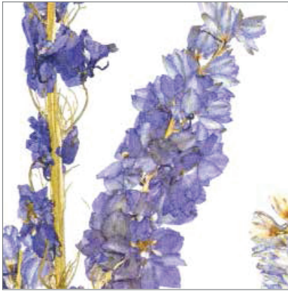
SCALE | 3 1/2" x 3 1/2" 9 x 9 cm Scale images based on approximate size of 48" x 96" sheet. (1219 x 2438 mm)