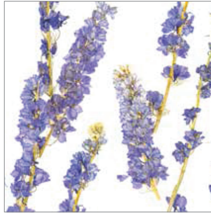
SCALE | 8" x 8" 20 x 20 cm