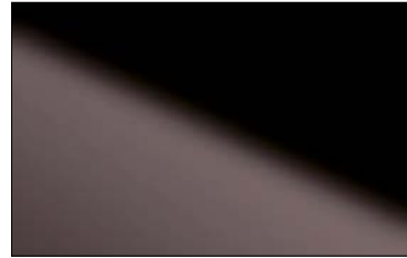
DM OPTICAL MIRROR Anthracite AR 2800 x 1250 / NA 21241