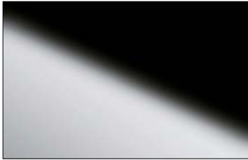
DM OPTICAL MIRROR Silver AR 2800 x 1250 / NA 20877