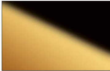
DM OPTICAL MIRROR Gold AR 2800 x 1250 / NA 21243