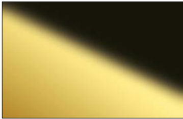
DM OPTICAL MIRROR Brass AR 2800 x 1250 / NA 21242